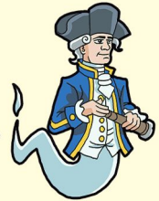
CAPTAIN GHOST COOK

Think about the things you love (or don't love) about Aotearoa. Would they be fun to include in a game? What are the challenges you might face when expressing local issues? Can you think of anyone who could help you deal with sensitive New Zealand topics through a 2D platformer?