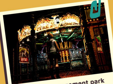
Lakeside amusement park (Silent Hill 3)

What terrible thing happened to make this place haunted? What sinister mystery do you want the players to solve? How are you going to both scare and thrill your players? How are the players going to escape this haunted place?